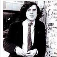
In the British Election, It's Posh, Posher, Poshest

Home | World | U.S. | N.Y. / Region | Business | Technology | Science | Health | Sports | Opinion | Arts | Style | Travel | Jobs | Real Estate | Autos | Back to Top Copyright 2010 The New York Times Company | Privacy | Terms of Service | Search | Corrections | RSS | First Look | Help | Contact Us | Work for Us | Advertise | Site Map