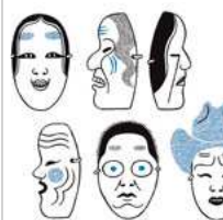
'I Rush Through the Japanese Night'