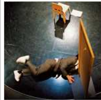
Theater of Invention, Evolving and Revolving