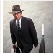
Some See Judge in 9/11 Suits as Interfering