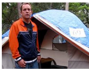
The tent city of Pinellas Hope, Fla. is home to many who never thought they would find themselves homeless...