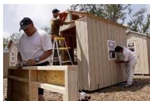
By Rod E. Millington, for USA TODAY